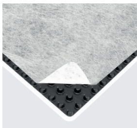
ND 120 Drainage System

High-performance CE-marked drainage system made out of recycled high impact polystyrene. The core of the ND Drainage System is a dimpled sheet with a high compressive strength, an excellent creep resistance guaranteeing a consistent long term drainage capacity and a construction height of approx. 8 mm. A non-woven geotextile is bonded to each dimple as a filter layer. The geotextile is glued and not thermally bonded to the dimpled core to avoid damage to the mechanical and hydraulic properties of the geotextile and the drainage system. It also prevents the geotextile to be pushed in between the dimples obstructing the drainage capacity. An additional pressure-dividing slip film is glued to the back of the dimpled sheet that acts as the first smooth, non-sticky surface of the slip layer and as an additional protection layer of the waterproofing membrane.